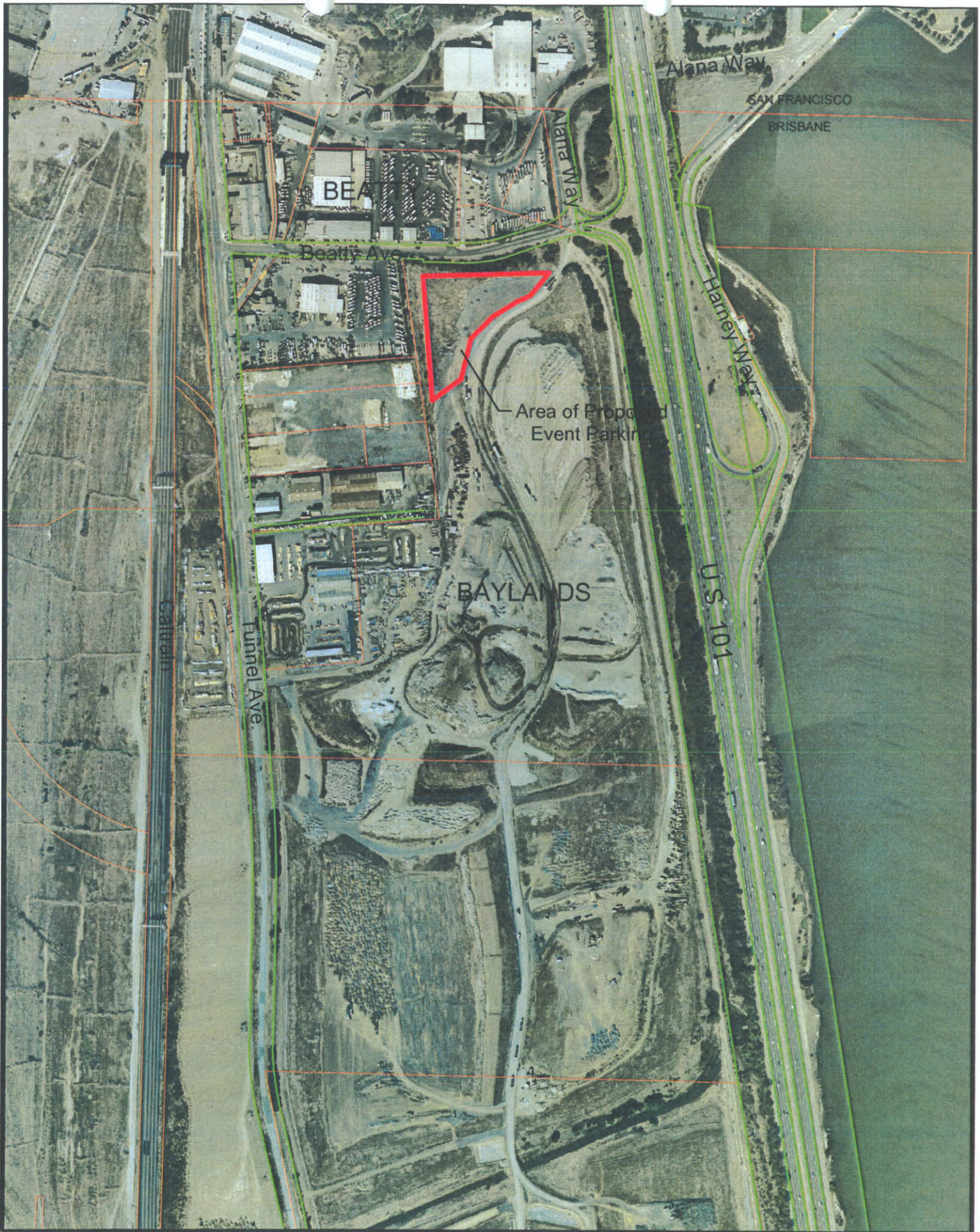
Area of Proposed 49ers Overflow Parking Baylands Subarea, Brisbane, California